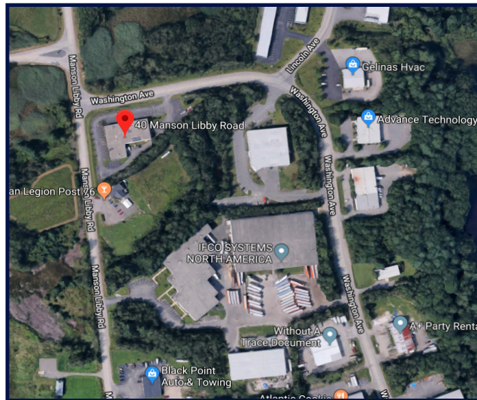
Aerial of 40 Manson Libby Road